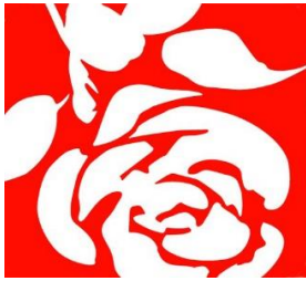
John McDonnell MP

Member of Parliament for Hayes & Harlington